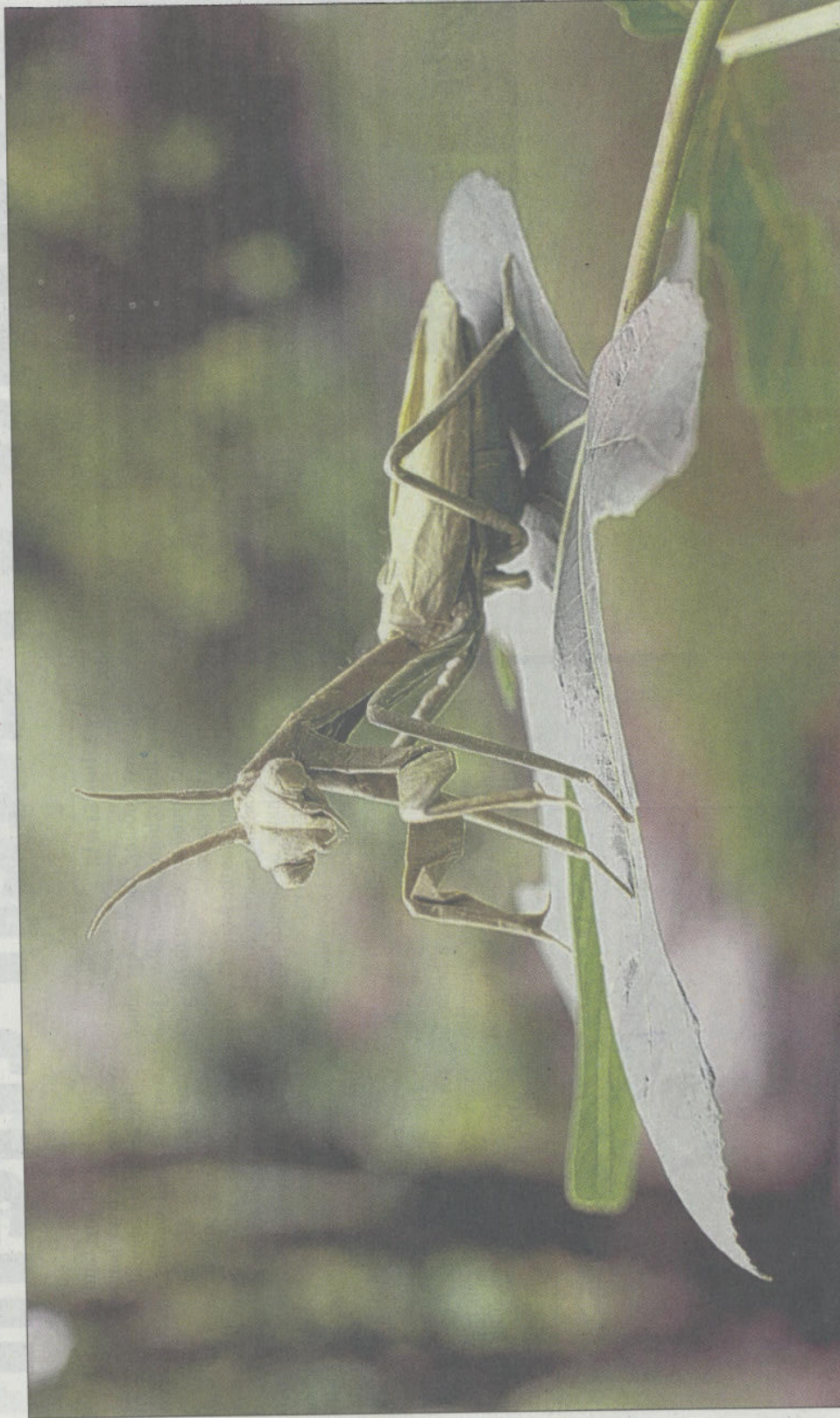
Almost real: The praying mantis is known to bite the head off her mate after making love. This one might give you a nasty paper cut

'The inspiration for me can be anything,' he said.