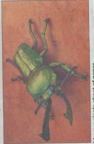
Real life or paper? All Mabona's models, including birds and the giant stag beetle, are folded from a single sheet of paper